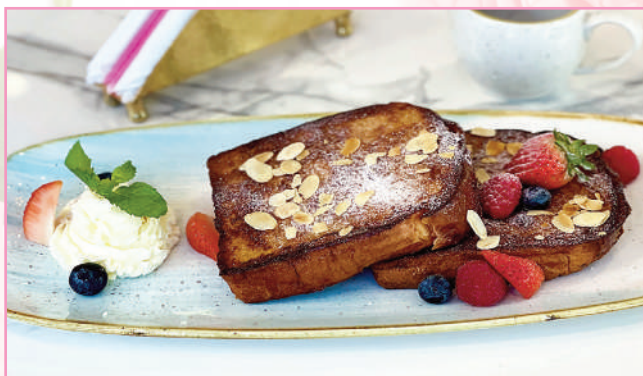
French Toast ..... 3.9 Served with fresh berries, maple syrup, our signature cream and topped with flaked almonds

Enjoy them at breakfast, brunch, with tea in the afternoon or after a main course meal