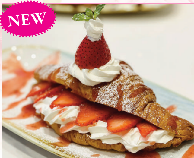
Strawberries & Cream Croissant ..... 3.5 Croissant filled with cream, fresh strawberries and jam