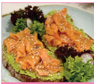
Avocado Toast & Salmon