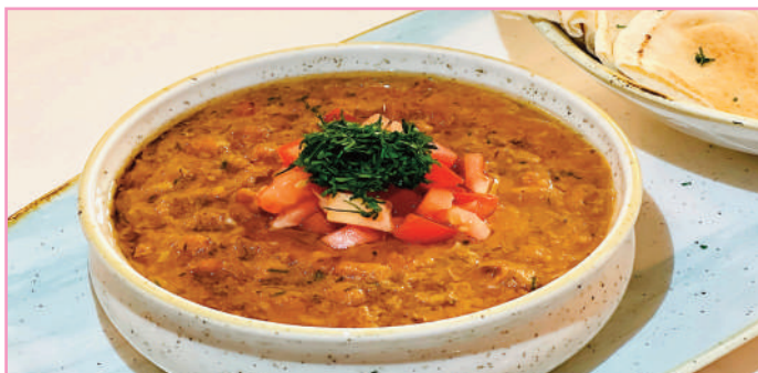
Foolish Foul Medames - Fava Bean