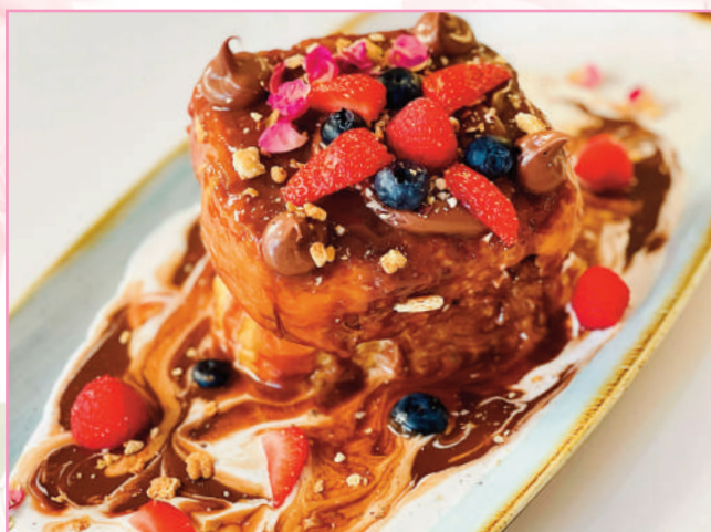
Naughty Nutella French Toast ..... 4.9 Served with fresh berries and our signature cream