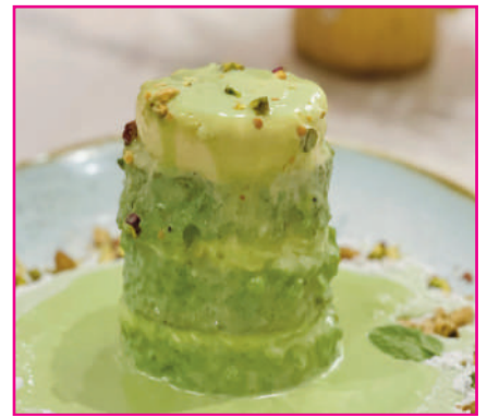
Pistachio 'Gherkin' ..... 4.5 Layers of pistachio cake, cream, ice cream pistachio sauce and pistachio nuts