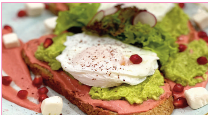
Poached Eggs, Avocado & Beetroot Hummus

All prices are in BHD and exclusive of 10% VAT