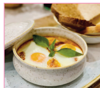
Fried Eggs with Beans