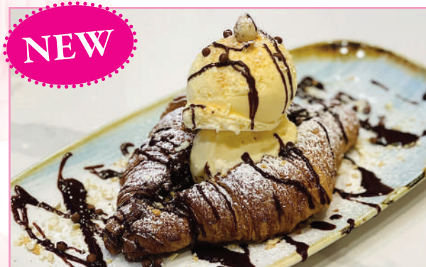
Nutella Croissant ..... 3.5 Croissant filled with Nutella and ice cream, topped with nuts and chocolate sauce