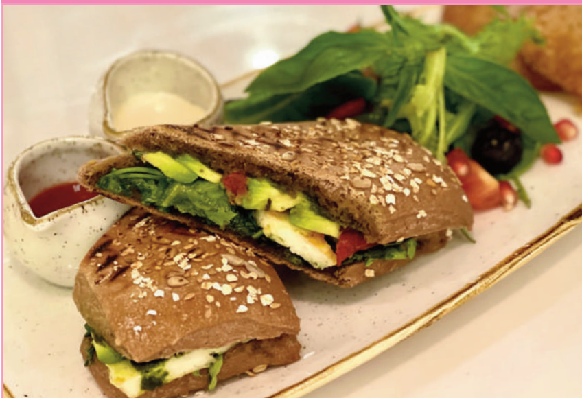
Halloumi, Avocado & Pesto