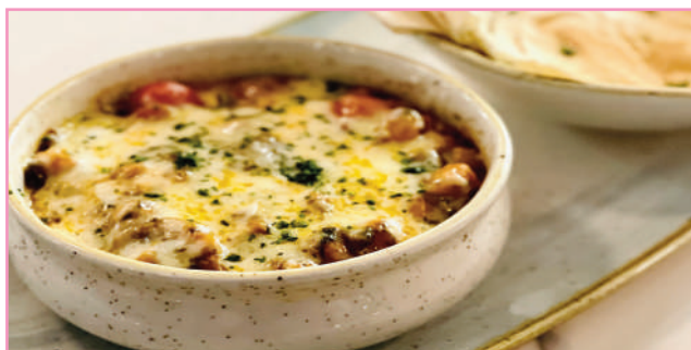
Reem's Special Cheesy Chickpeas