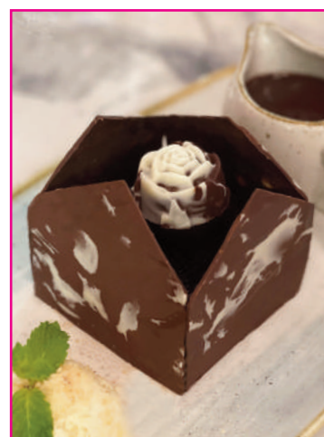
Chocolate 'Shard' ..... 4.5 Chocolate brownie served with hot pouring chocolate sauce and ice cream