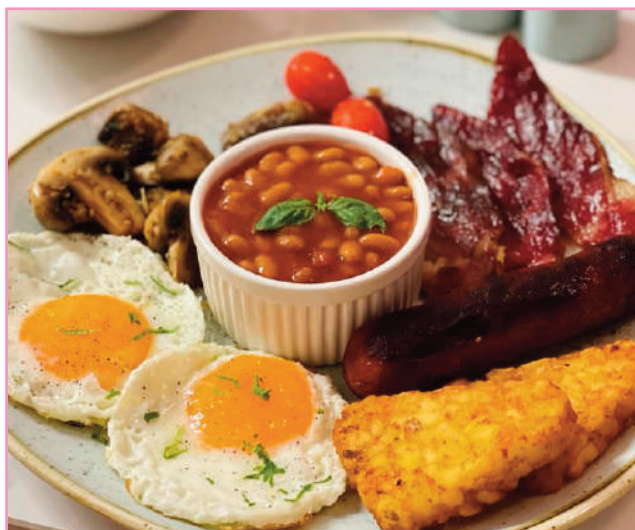
Full English Breakfast