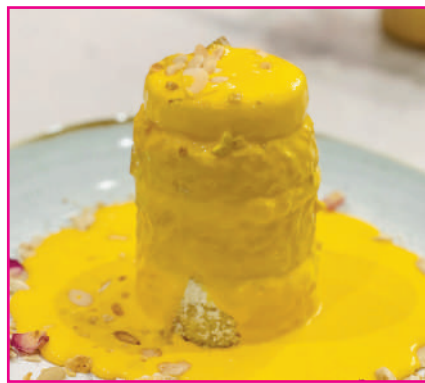
Saffron 'Big Ben' ..... 4.5 Layers of saffron cake, cream, ice cream, saffron sauce finished with nuts and edible rose petals