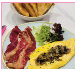
Mushroom Omelette with Bacon