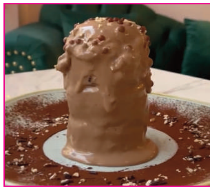
Nutella 'Tate' ..... 4.5 Layers of chocolate cake, cream, ice cream, Nutella sauce finished with hazelnuts