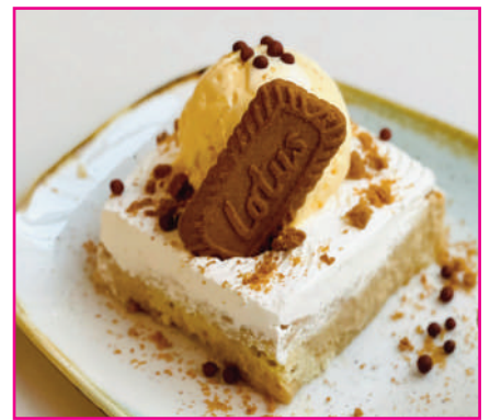
Lotus 'St. Pauls' ..... 4.5 Lotus cake base with cream, ice cream, lotus sauce, lotus biscuit and chocolate balls