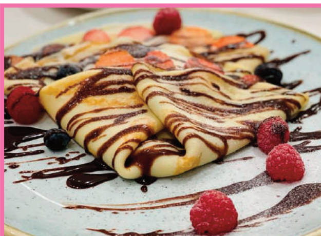
Our Anytime Crepe

A Freshly Made Crepe and Fruit with a choice of Chocolate or Caramel Topping