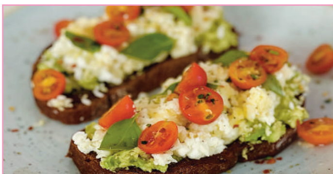
Caprese Avocado Toast with Scrambled Eggs