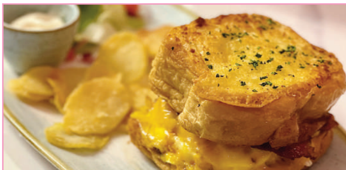
Egg, Bacon, & Cheese in a Brioche Bun