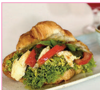
Halloumi & Avocado Croissant