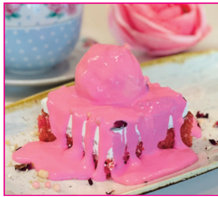
Rose 'Royal Albert' ..... 4.5 Delicious rose cake with cream, ice cream cream and a mouthwatering rose sauce, surrounded by rose petals