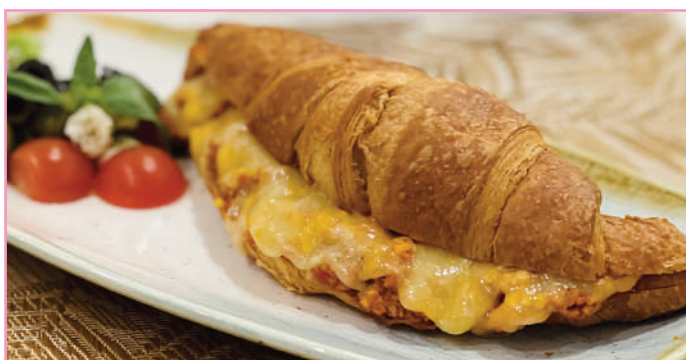
Shakshuka Croissant with Cheese

Perfect for breakfast, lunch or with tea in the afternoon 3.5