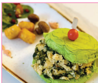
Hulk Roll - Let's go Green

Two Eggs - Just how you like them ..... 1.0