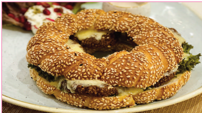
Falafel Bagel with Cheese

All prices are in BHD and exclusive of 10% VAT