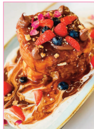
Naughty Nutella French Toast

See our new 'Sweet Things' on the dessert page